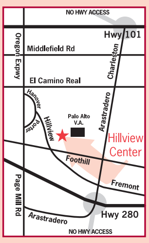
HILLVIEW DONOR CENTER 3373 HILLVIEW AVENUE PALO ALTO, CA 94304