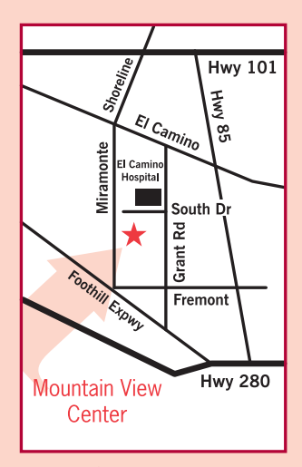
MOUNTAIN VIEW DONOR CENTER

515 SOUTH DRIVE, SUITE 20 MOUNTAIN VIEW, CA 94040