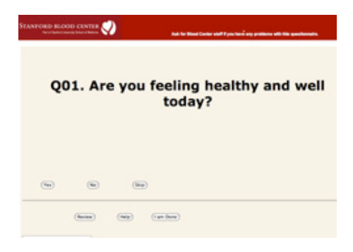
A sample question screen from the new system.

This summer, SBC will upgrade to new software that better manages the way we obtain donor health history information.