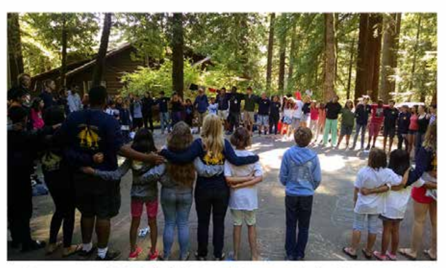
Support SBC Kids to Camp this Summer!

Connecting our communities to provide hope for healing.